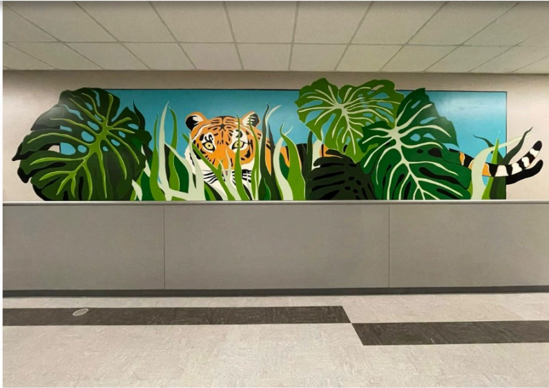
7. Jimmy Hayley Entrance, Texas City, 2024