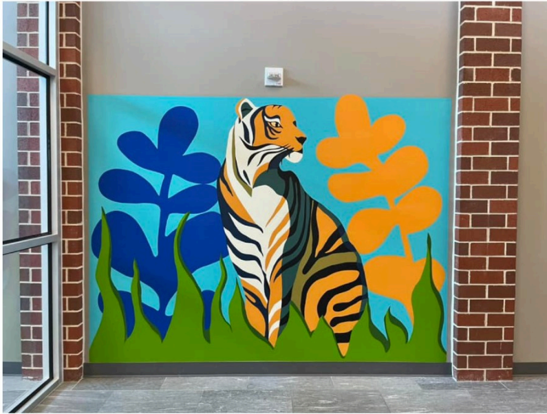
8. Houston Tool Bank Shed, Galveston 2025